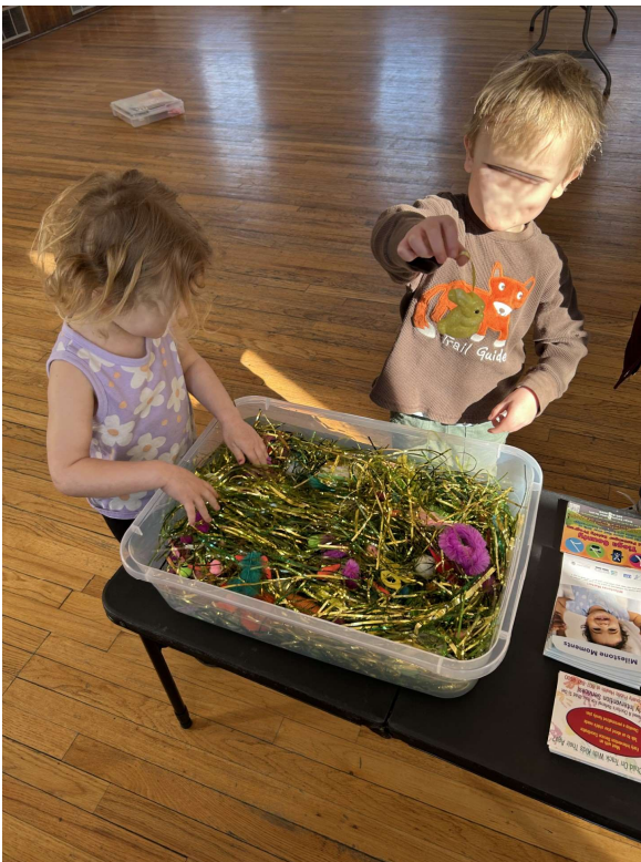
Example of Sensory Bins Brought to Spencer Family Resource Center by EISCs, March 2025.